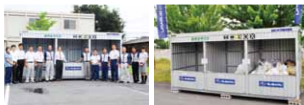
Eco Box of FUJI HEAVY INDUSTRIES HOUSE Co.,Ltd., placed at rally competition site

By supporting motor sports competitions as a means to promote car culture, we will cooperate in maintaining clean event sites and preserving the environment.