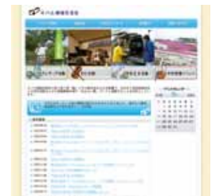
SUBARU Community Exchange Association Website

http://www.chiiki-kouryuukai.com/index.html