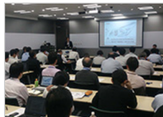
Compliance training (Head Office)