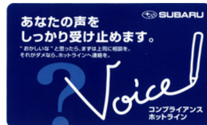
Compliance Hotline Card