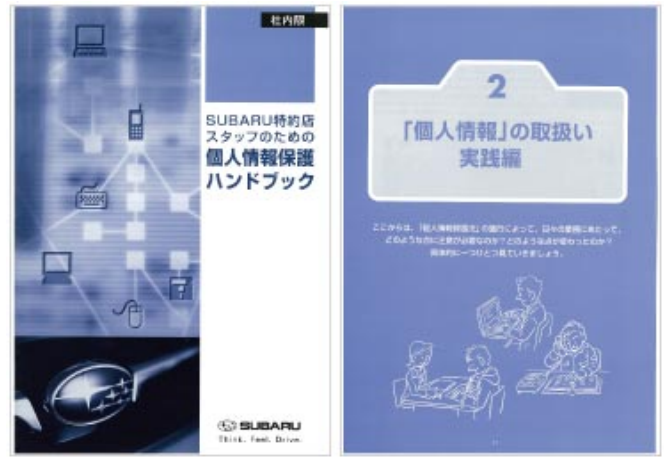
Handbook for SUBARU Dealer Staff

Since Subaru dealers in Japan handle a wide range of customer information, we have reviewed the compliance of each of the 44 dealers, including affiliated companies, with our rules and created a Personal Information Protection Handbook for Subaru Dealers. In this way, we are working to ensure that all employees understand the importance of protecting personal information.