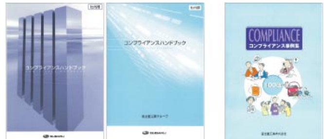
Left: Compliance Handbook for Affiliated Companies Right: 100 Case Studies of Compliance Issues

We also prepare and provide various support tools, including ones specially intended for affiliated companies and domestic SUBARU dealers, to promote compliance in day-to-day operations. Urgent information is released on a timely basis in our "Compliance Information" to alert the entire group.