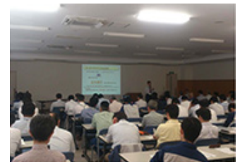
Compliance training (Tokyo Office)