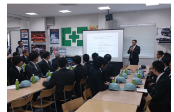
Plant tour for Aerospace Company suppliers conducted through a "Cooperation Meeting"