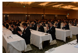
"General Cooperation Meeting" for SUBARU Automotive Business suppliers

Once a year, FHI awards those partners that have particularly contributed to technology and quality.