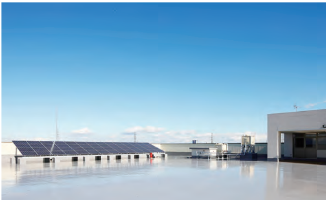
Solar power cells installed on the roof of the new administration building