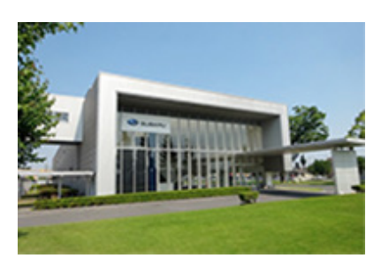
SUBARU Visitor Center

Opened to the public on July 15, 2003, the Subaru Visitor Center welcomes people who visit the Yajima Plant for tours of the plant and other reasons. Inside the center, visitors can view historic SUBARU models and cars that set world records, as well as learn more about SUBARU's unique technologies and environmental initiatives. In FY2017, 88,909 people visited the facility.