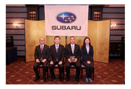
One employee commended (second from the right) and Subaru officers

As a specific example, an award system to honor employees who contribute to the community and society by actively volunteering was established in 2006. This award was established in 2006, and at the 12th Award Ceremony in June 2017, we commended one employee.