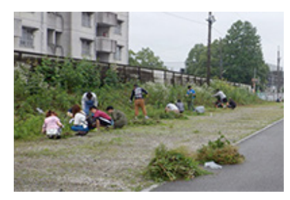
Clean Campaign of Utsunomiya Manufacturing Division

We periodically conduct clean-and-beautify your neighborhood activities by employees in the vicinity of each of our offices and plants. In FY2017, a cumulative total of approximately 4,800 employees, including 400 employees of Utsunomiya Manufacturing Division, took part in the activities. We plan to continue these local clean-and-beautify activities.