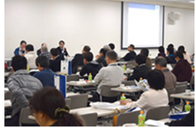
Plant tour for shareholders in FY2017