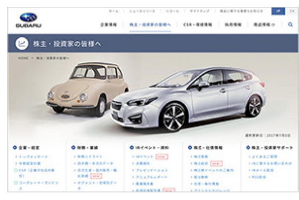
Webpage "Investor Relations"

Moreover, we offer an IR newsletter service to distribute the latest IR information, such as statement details, by email to those who register. Approximately 1,500 people are currently registered for the free IR newsletter service.