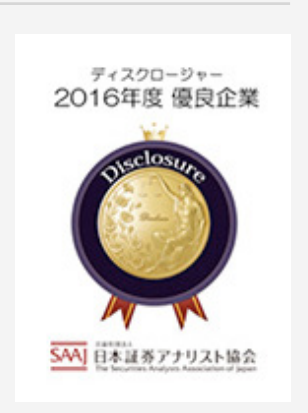
Logo of the Awards for Excellence in Corporate Disclosure

We were ranked first in the Automobile/Parts/Tires industry area by The Securities Analysts Association of Japan in its FY2017 Awards for Excellence in Corporate Disclosure. It was the third year in a row that we received this award. We ranked highly, placing first out of 18 companies in our industry area in four of the five evaluation categories.