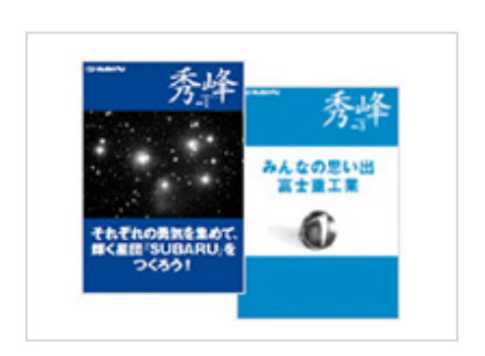
In-house magazine "Shuho"

Every month, an in-house magazine is published for the purpose of sharing information on corporate policies and initiatives as well as boosting the motivation of employees and promoting communication. So far, we have published over 730 issues since the first printing in April of 1956. In February 2014, we began posting internal information on our intranet in an effort to provide information to employees on a broader and more timely basis.