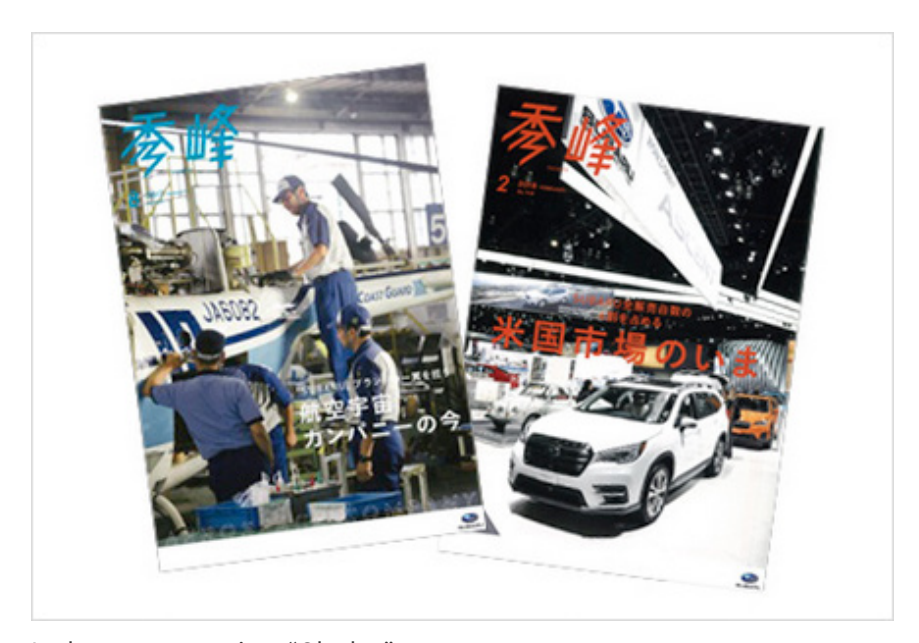
In-house magazine "Shuho"

In addition, Subaru has a means to promote direct communication with employees through periodical visits by management to each place of business and workplace.