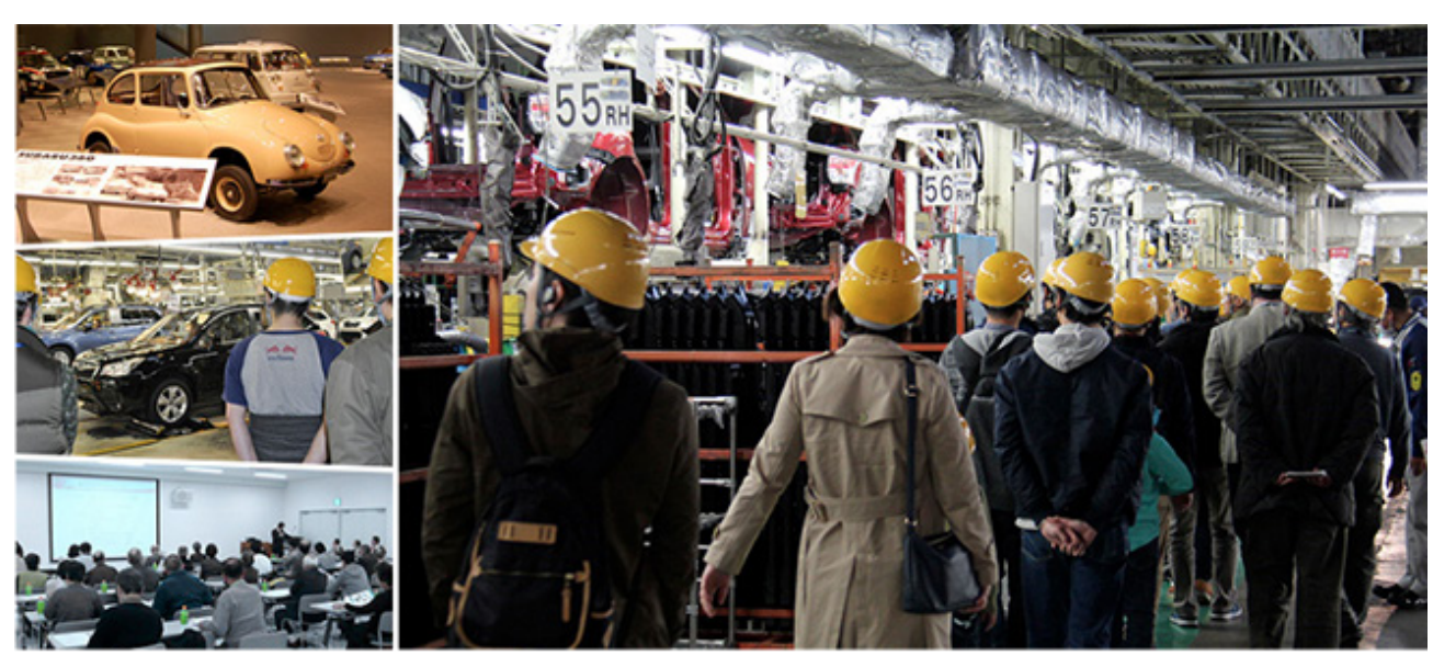
Plant Tours for Shareholders at Gunma Plant

Subaru reports the opinions and comments Subaru receives at the tours to the relevant people at the company, including officers, and utilize them in our future IR activities.