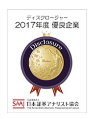
Logo of the Awards for Excellence in Corporate Disclosure

This Award has been presented every year with the goal of improving corporate information disclosure. This year marks the 23rd year since the start of this award system. Companies are evaluated by securities analysts of each industry on the basis of the following five criteria: 1) management's stance on investor relations, the function of the corporation's investor relations department, and basic stance on the corporation's investor relations; 2) disclosures through briefings, interviews, and explanatory materials; 3) fairness in disclosure; 4) disclosure related to corporate governance; and 5) voluntary disclosure in accordance with the conditions of each industry.