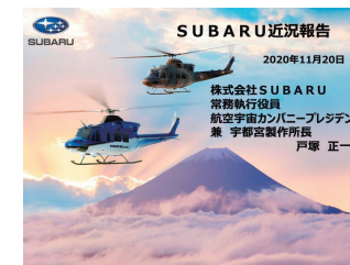
SUBARU Status Report Meeting held with Aerospace Company business partners