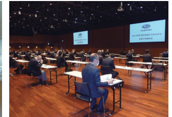
Policy Briefing and General Cooperation Meeting (joint) held with Automotive Business Unit business partners