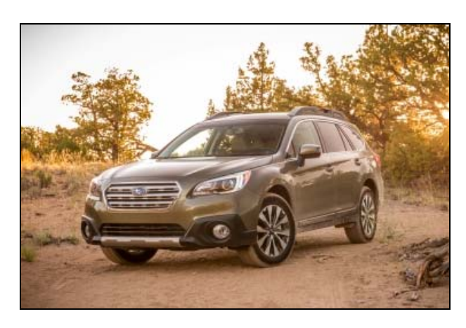
All-new 2015 Outback (US specifications)