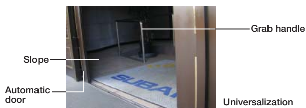
Slope Automatic door

We have voluntary standards for every item, some of which are at very high levels, some being five times more stringent than the law requires. We are also promoting improvement of lounges, rest rooms and dining hall and universalization of facilities in order to create workplaces where employees can work comfortably.