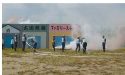
2002 Gunma General Emergency Drills (Gunma Manufacturing Division)

Fires and natural disasters such as wind and flood damages and earthquakes would influence our business activities, employees and local communities. We are making efforts to prevent fires and disasters by improving facilities and equipment, enhancing management and repeating emergency drills in order to make no fires and minimize damages if a natural disaster should happen.