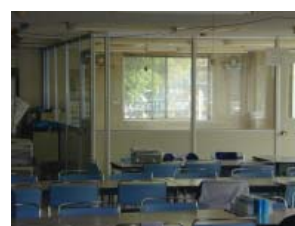
Separation of a smoking area in a lounge