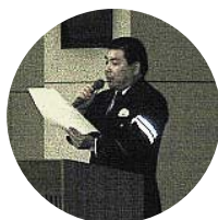
A lecturer came from the traffic division of the Ota Police Station