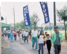
The walking rally (Gunma Manufacturing Division)