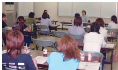
A workshop for working women Theme: Health check-up when feeling tired in summer

They can ask questions about their health casually and give and take information to spend their working life comfortably in happy harmony.