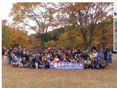
The seventh walking rally (Utsunomiya Manufacturing Division)

As for mental health, everyone feels stress more or less as we are said to be in a stressful society. To deal with mental issues, listener education for taking care of the workplaces and lines was conducted, and a counseling service was provided for staff. Athletic and Cultural Association and Corporate Health Insurance Society holds a walking rally at each production base every year.