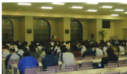
Training sessions for traffic safety and accident prevention

As part of educational campaigns of traffic safety and accident prevention, seven training sessions over about two weeks targeting at young employees younger than 25 years old and group leaders, and about 1,450 employees attended the training session.