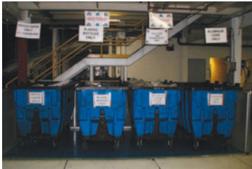
Separation of waste materials: Boxes to separate paper from offices, plastic bottles and aluminum cans

This company conducts many activities such as installation of equipment to purify and reuse cleaning thinner in paint process as well as separation of waste materials, thinning out lights in walkways, cleaning and reusing cotton work gloves.