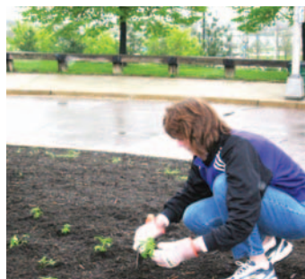
They are attending cleanup activities of public facilities in Camden on Arbor Day, Earth Day and during national volunteer workweek.