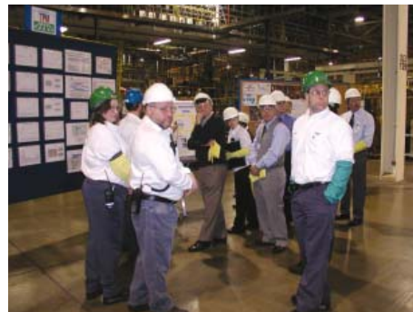
Presentations about activities in SIA's plant.