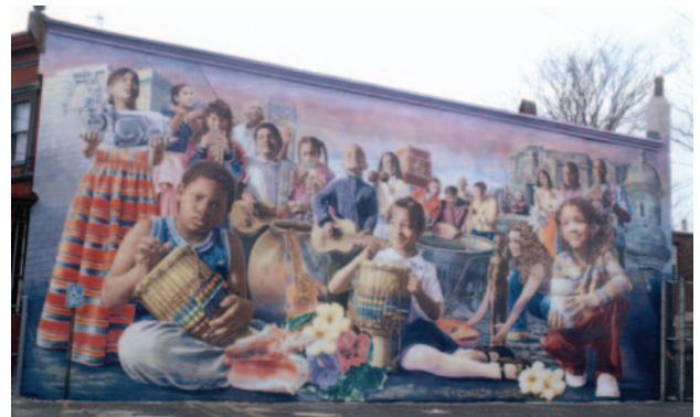
Molina School's Wall Painting (Camden, New Jersey)

SOA continually assists cleanup activities of highways over against its headquarters.