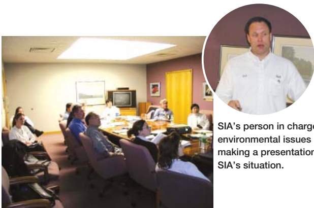
SIA's person in charge of environmental issues is making a presentation about SIA's situation.

In February 2003, people in charge of environmental issues in these affiliated companies and members of FHI's Environmental Affairs Promotion Office got together in SIA, Subaru's production base, to report each company's situation, exchanged opinions about future activities and observed the environment conservation activities in SIA's factories.