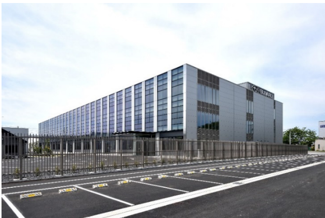
Main Administration Building

*3: The amount of electricity generated by the solar panels installed on the building and the reduction of electricity in existing buildings were calculated using the CO 2 emission coefficients of TEPCO Energy Partner, Inc. for 2021 (0.451kg-CO 2 /kWh).