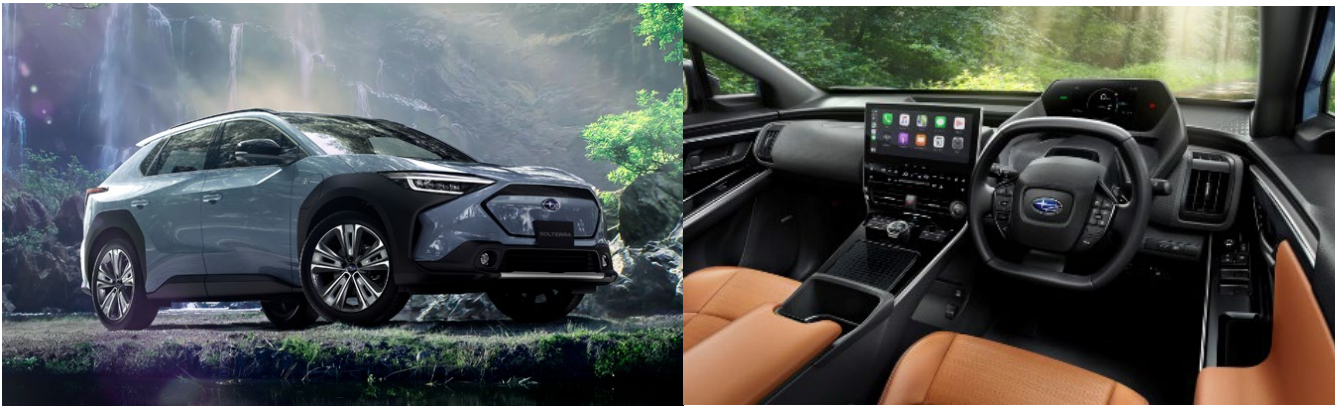
Solterra ET-HS (Japanese specification model)

The Solterra is Subaru's first global battery electric vehicle (BEV), infused with new values inherent to electric vehicles as well as the "Enjoyment and Peace of Mind" that Subaru has cultivated over many years. Developed to be an authentic SUV in an environmentally friendly package, the Solterra maintains the practicality found in existing Subaru models, giving Subaru customers a choice, they can confidently embrace.