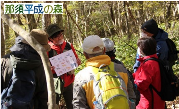
Nasu Heisei-no-mori Forest at Nikko National Park (Scene of activities by the interpreters* 3 )