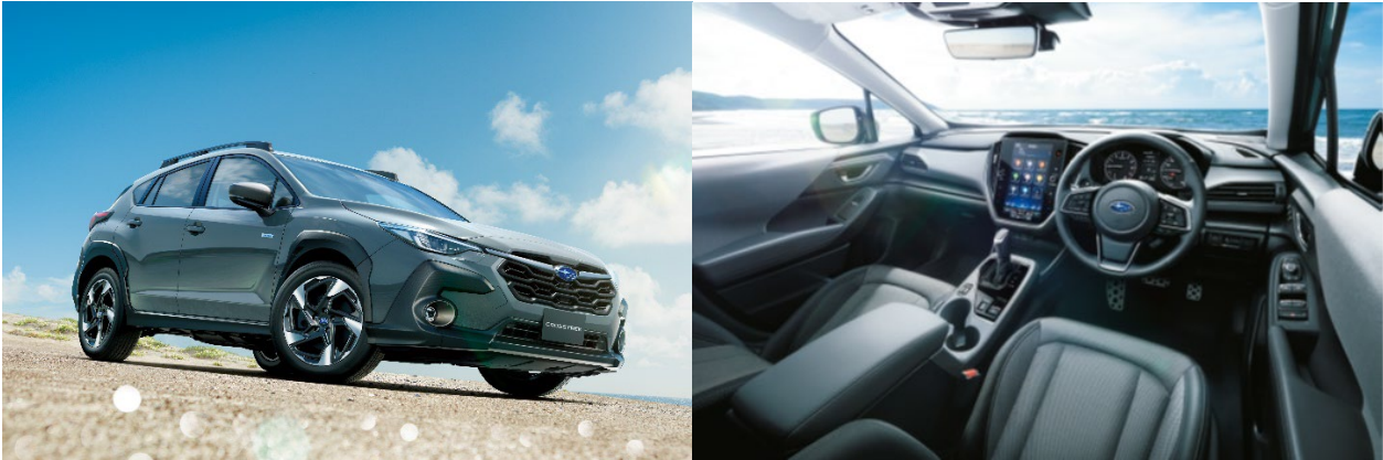
Crosstrek Limited (Japanese specification model)

Combining a compact body with a rugged and sporty design, the Crosstrek features full-fledged SUV performance, making it a versatile crossover SUV ideal for any driving environment, whether in the city or for outdoor adventures. In this third-generation model, not only has the unique design of the previous model been emphasized, but also the driving dynamics and safety performance of the Crosstrek have been refined.