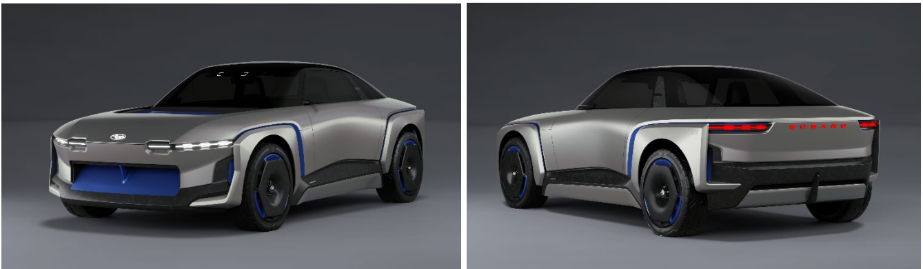
SUBARU SPORT MOBILITY Concept

This concept model expresses the enjoyment that Subaru offers in the age of electrification, embodying the pleasure of going anywhere, anytime, and driving at will in everyday to extraordinary environments. Driving with peace of mind allows us to embark on exciting new adventures. This is a battery electric vehicle (BEV) concept that evokes the evolution of the SUBARU SPORT values.