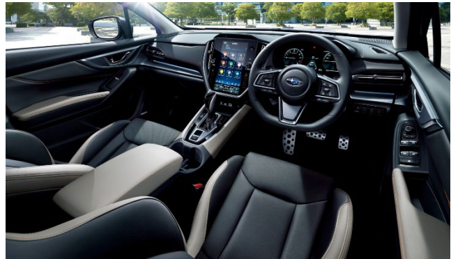
Levorg Layback Limited EX (Japanese specification model)

The all-new Levorg Layback combines the three values of Levorg, advanced safety, sportiness, and value as wagon, with the flexibility as SUV and high quality. It is developed for the Japanese market as a unique SUV in Subaru's extensive SUV lineup.