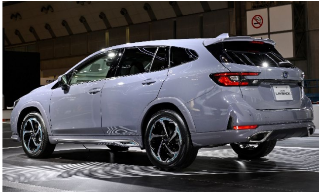
Levorg Layback Limited EX Genuine Accessory Parts equipped model (Japanese specification model)

Levorg Layback with Subaru genuine accessories, which expresses its high quality and sophisticated style by coordinating the cladding with the body color.