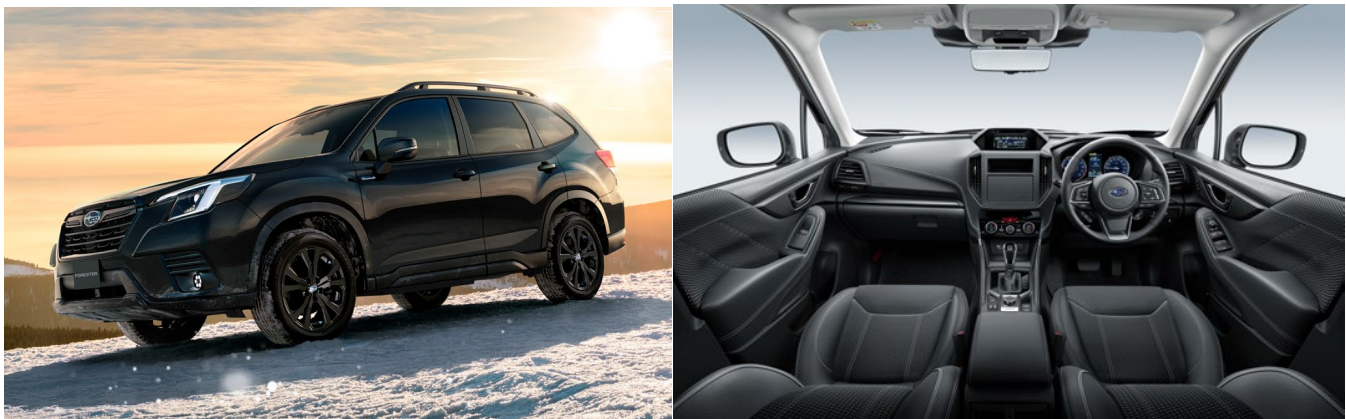
Forester X-EDITION (Japanese specification model)

Forester is positioned as a key part of the company's global strategy. Forester features packaging that allows all passengers to share comfort and enjoyment, balancing easy handling with a spacious interior, and user-friendly features. The design combines the hardiness of an SUV with user-friendly comfort and convenience.