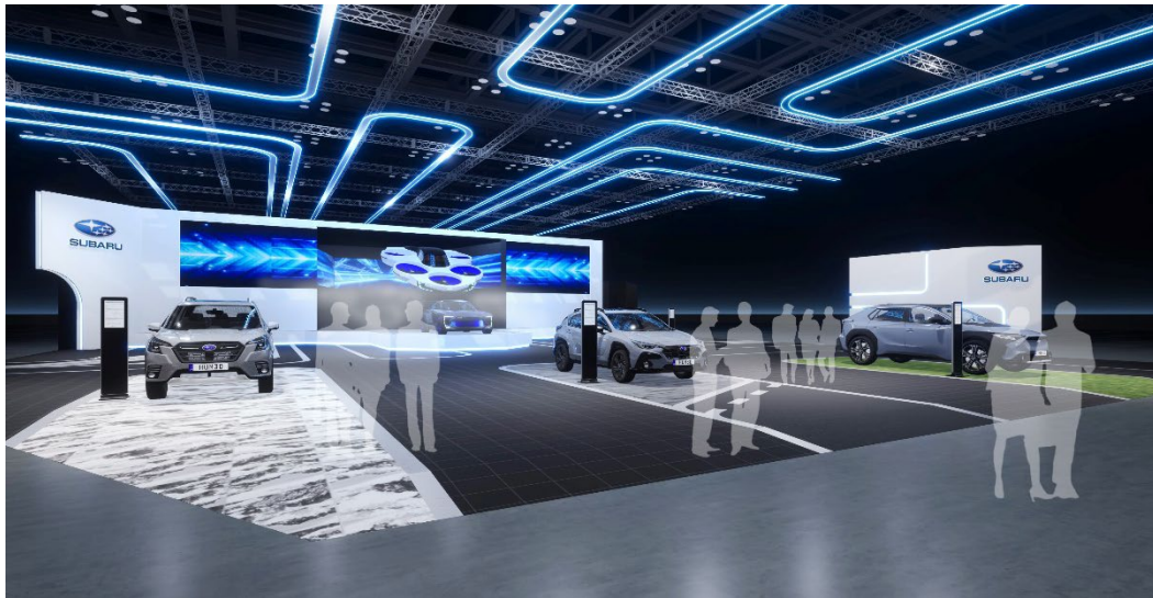
Subaru Booth Rendering

Tokyo, October 25, 2023 – Subaru Corporation has started its exhibition at the JAPAN MOBILITY SHOW 2023 (Press Days: October 25–26, Public Days: October 27–November 5, 2023). The Subaru booth showcases Subaru's vision of future mobility and communicates Subaru's efforts to strengthen its bond with society, allowing visitors to experience "Enjoyment and Peace of Mind" for today and the future.