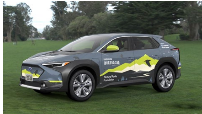
Nasu Heisei-no-mori Forest patrol car (Solterra, image)

With our background of having an aircraft making DNA, Subaru places the highest priority on safety in “People-Centered Monozukuri (Manufacturing)” and holds “Protection of Life” to be important. Based on the idea of “Protection of Life” as the core of activities, Subaru will engage in the “Cherishing Every Life Project” as an initiative to be carried out together with customers, dealers, Subaru and local residents. “Human life” is irreplaceable and “natural life” takes care of rich forests and wildlife. We will continue to support those who are working to “protect and pass those on to a future full of smiles”.