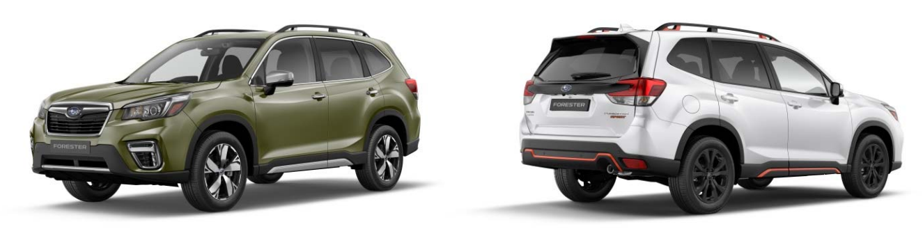
All-new 2019 Forester (US Spec)

Tokyo, March 29, 2018 – Subaru Corporation unveiled the all-new 2019 Forester (US Spec) at the 2018 New York International Auto Show on March 28 (local time).