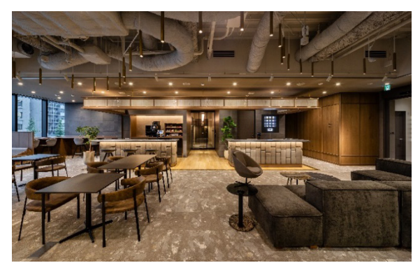
H¹O Shibuya 3-chome shared lounge (for illustrative purpose)