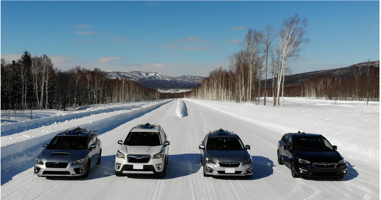
Test vehicles with 5G and C-V2X systems for this verification in Bifuka Proving Ground (from left): Subaru WRX S4, Forester, Impreza SPORT (x2)